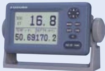
Remote Display RD-30

■ The PG-500 complies with IMO MSC.116(73) when fitted with the RD-30 that indicates manually entered corrections. The PG-500 is not type approved to ISO 22090-2; ask your administration if it satisfies the SOLAS carriage requirements.